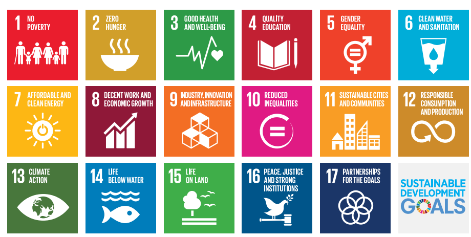
Figure 2.1 Sustainable Development Goals

The United Nations SDGs include a set of 17 Global Goals which cover, more categorized from a policy than from a scientific point of view, urgent tasks to be addressed by national governments, local authorities and private actors. A detailed analysis of the differences and overlap between the Triple P approach, used in the National monitor sustainable municipalities, and the 17 Goals of the SDGs shows that a large part of the indicators are the same but for some goals clear differences occur. Goal 14 on seas and oceans is not included because this is not relevant for municipalities, and goal 5 on gender issues and 17 on partnerships are poorly represented. Social inequality, goal 10, as such is not an angle from which issues have been framed very often in the past in the Netherlands. Governance issues, as implemented by partnerships, have explicitly not yet been included in the Triple P approach, amongst others because of the different nature of this domain and because comparable data are difficult to collect.